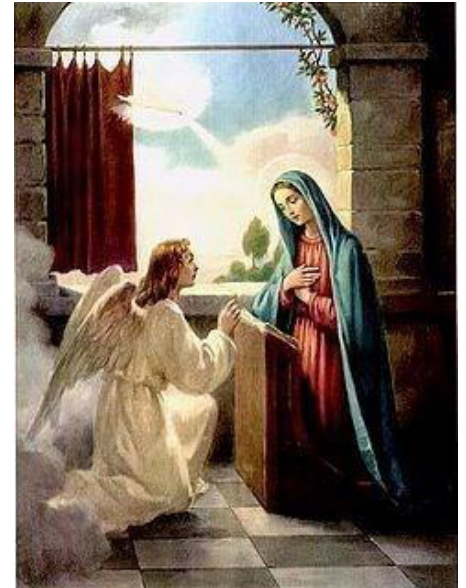
The Annunciation, March 25

stjohnsgild@yhti.net by Noon on Wednesday.